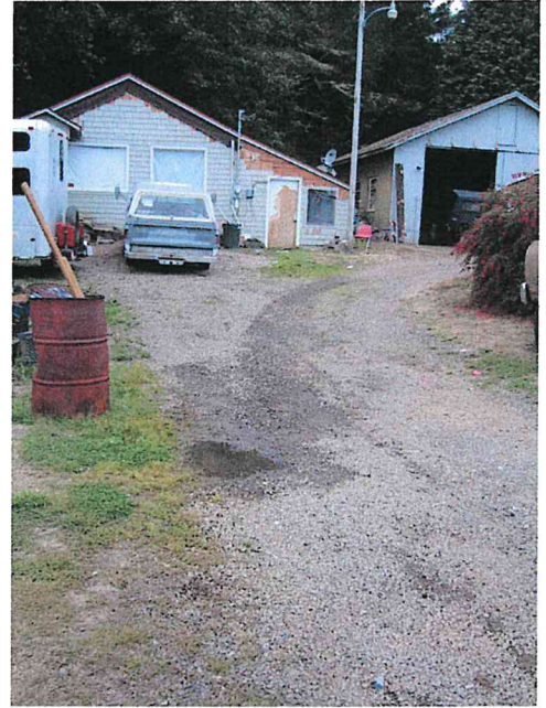
710-9DC-3800 – McNeeley Property, Photos taken 9/28/05